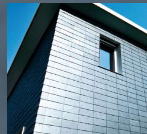
Modern architecture is effectively staged by slate.