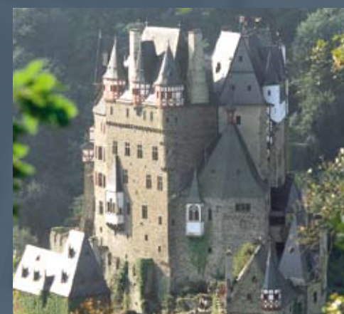
Eltz Castle, not far from the Moselle River. A popular destination for tourism with a marvellous roof landscape made of Moselschiefer ®.

The slate mining in Mayen is for the first time verified by a document from the year 1362 where the Mayen roofing slate – Leyen – thus the historical term for slate – from Katzenberg is mentioned. The original transport route via the Moselle River in about 1588 already gave the much sought-after material its name. Moselschiefer ® is thus worldwide one of the oldest trademark terms and up to today it stands for roofing slate in top quality from Germany.