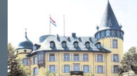
The Genoveva Castle. Symbol of Mayen.

The mountain below it is the home of the "Deutsche Schieferbergwerk" – German Slate Mine – whose formation goes back to our ideas and our support towards the town Mayen and it shows the history of the slate with exciting experiences.