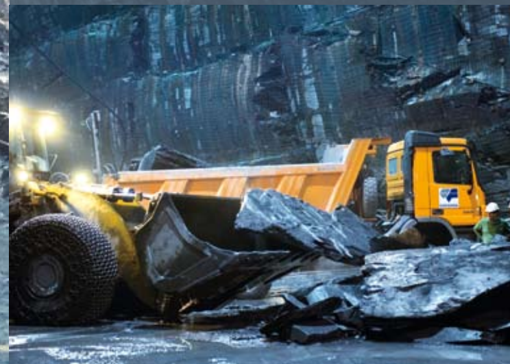
The world's largest slate mine – "La Fraguíña" in Spain. Slate mining in a very big way.

Our affiliated company CAFERSA. One of Spain's most important slate producers. Here we mine a large part of our InterSIN® slate.