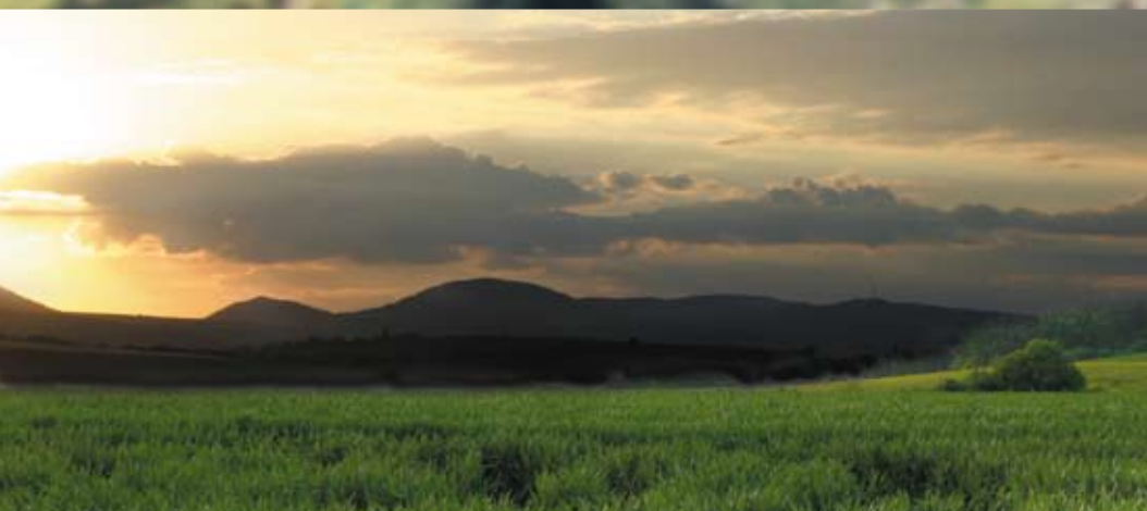
Peak of a volcano in the rising sun. A typical picture of the Eifel landscape.